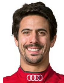
Lucas di Grassi

facebook.com/alotterer twitter.com/andre_lotterer instagram.com/andre_lotterer